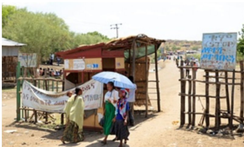
A checkpoint in Metema, next to the border with Sudan. The town is now the centre of a booming trade in migrants from Ethiopia, Eritrea, Somalia and Sudan.