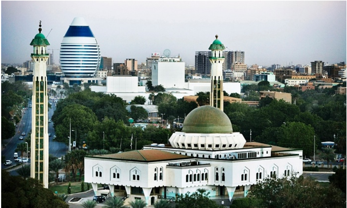
Khartoum with its oil boom era architectural constructions