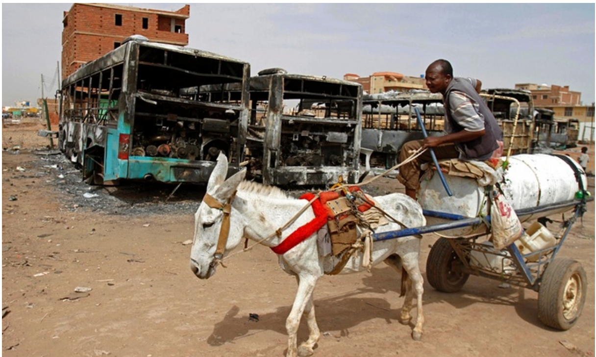
Streets in Khartoum

During the 2004-2011 oil boom and before the separation with the South Sudan, Khartoum offered a wide range of work opportunities for migrants and refugees. Yet, since the creation of South Sudan and the cutting off of main oil supplies to the North, Khartoum's economic growth and expansion has declined. This is most visible from the unfinished construction projects that were going to transform the landscape of this historically sleepy and slow-pace city into a global bustling metropolis.