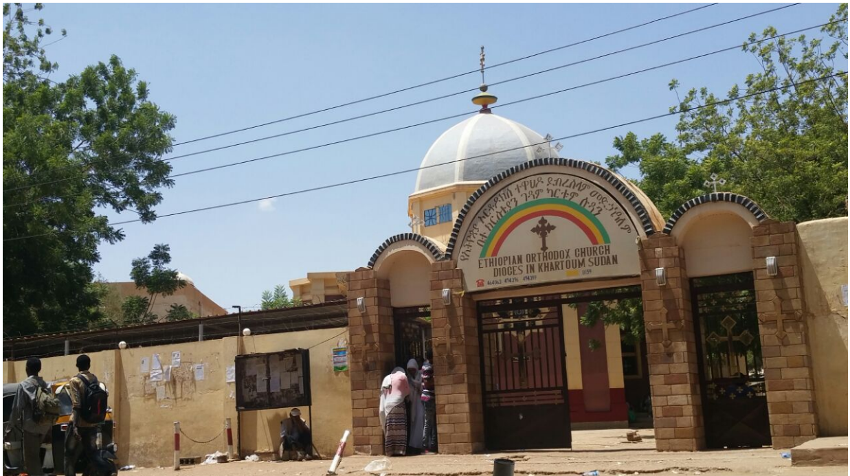
Ethiopian Orthodox Church, Khartoum

Churches are not only a place where people can gather. They also offer financial support, accommodation, food and, at times, facilitate further migration (through arranged resettlement or marriages). For example, one of the Pentecostal chapels rents a guesthouse and accommodates people recently arrived in the country. ‘This is so that they can sort their lives out in the first months in Khartoum. To find a job, to find accommodation. After a few months, they have to move out’, explained a young Eritrean pastor. The help was usually for the members of the Church, but I also witnessed the Church helping non-members.