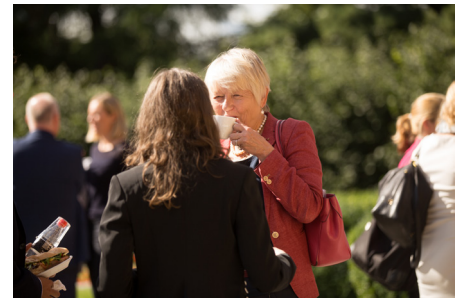
Oslo 2016