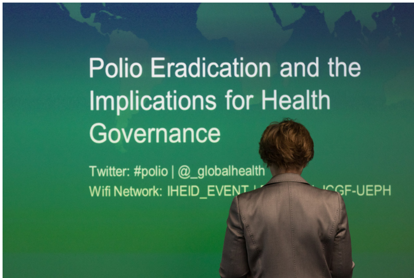
Geneva 2016, © GHC/S. Deshpriya