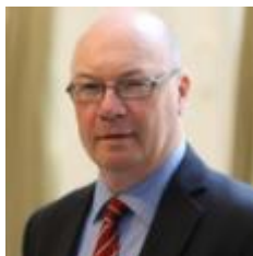
Alistair Burt Department for International Development

Alistair Burt was appointed Minister of State for the Middle East at the Foreign and Commonwealth Office and Minister of State at the Department for International Development on 13 June 2017. He entered Parliament for the first time in 1983 and was elected Conservative MP for north east Bedfordshire in 2001. Alistair served as Minister of State for Community and Social Care at the Department of Health from May 2015 until July 2016. Previously he served as Parliamentary Under Secretary of State in the Foreign & Commonwealth Office from May 2010 until October 2013.