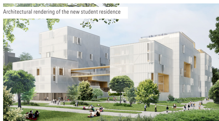
Architectural rendering of the new student residence

The Institute is building a new, 650-bed student residence. World-renowned architect Kengo Kuma was chosen after a competition to realise this project.