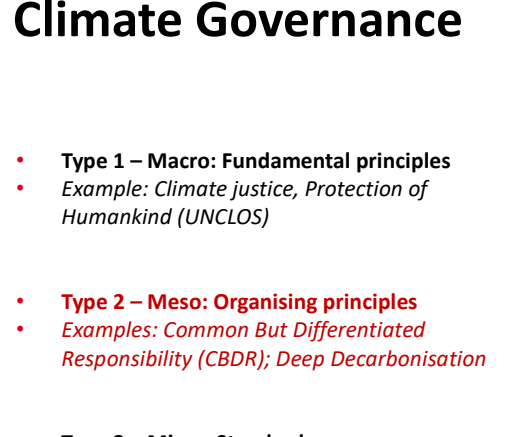
Table 1: Norm Typology