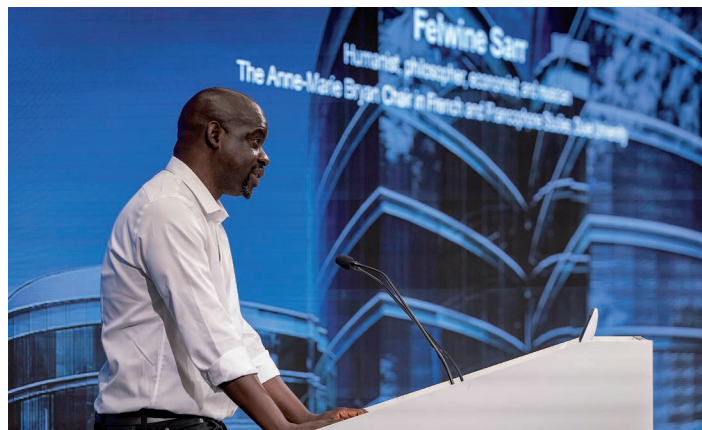
Felwine Sarr was invited to the Opening Lecture of the 2021–2022 Academic Year on “A Rise in Humanity”.