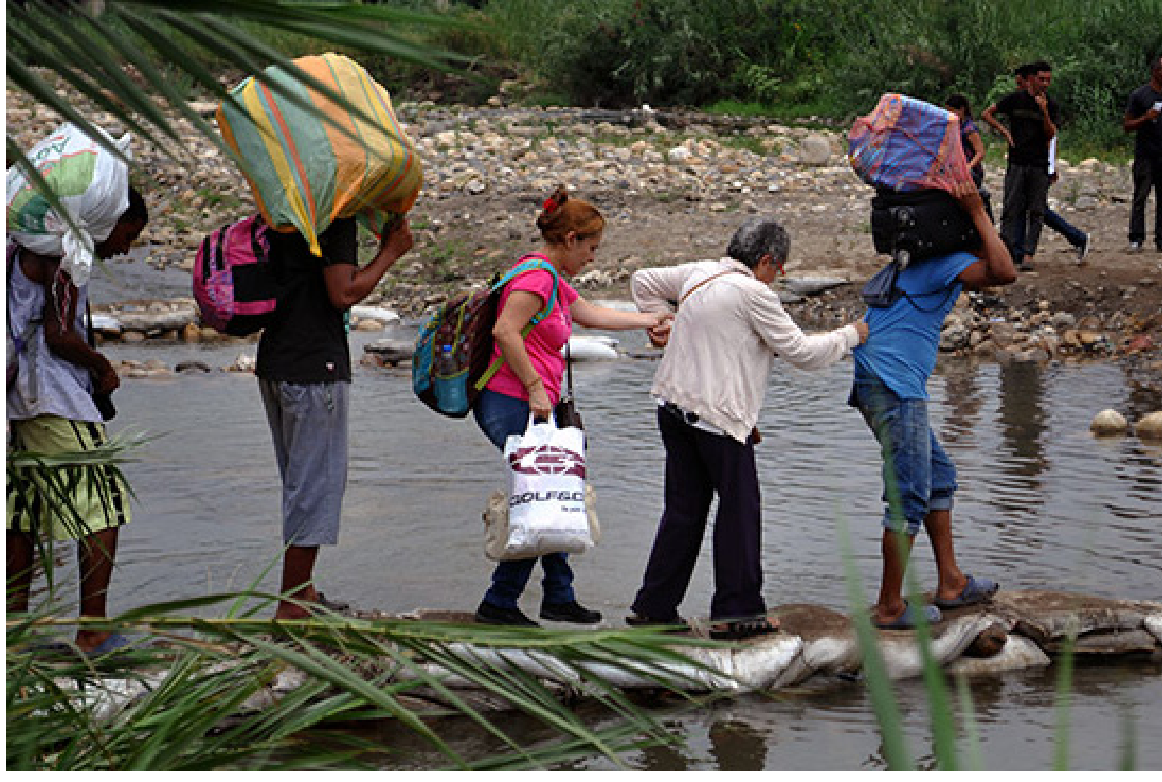
Figure 7. Footage people are bypassing immigration controls as they exit Venezuela.

All the information collected will be encrypted and stored in a secured program. If the caller does not want to share sensitive information such as their name and location, the volunteers will respect their decision, won't force them, and will support them in the means of their possibilities.