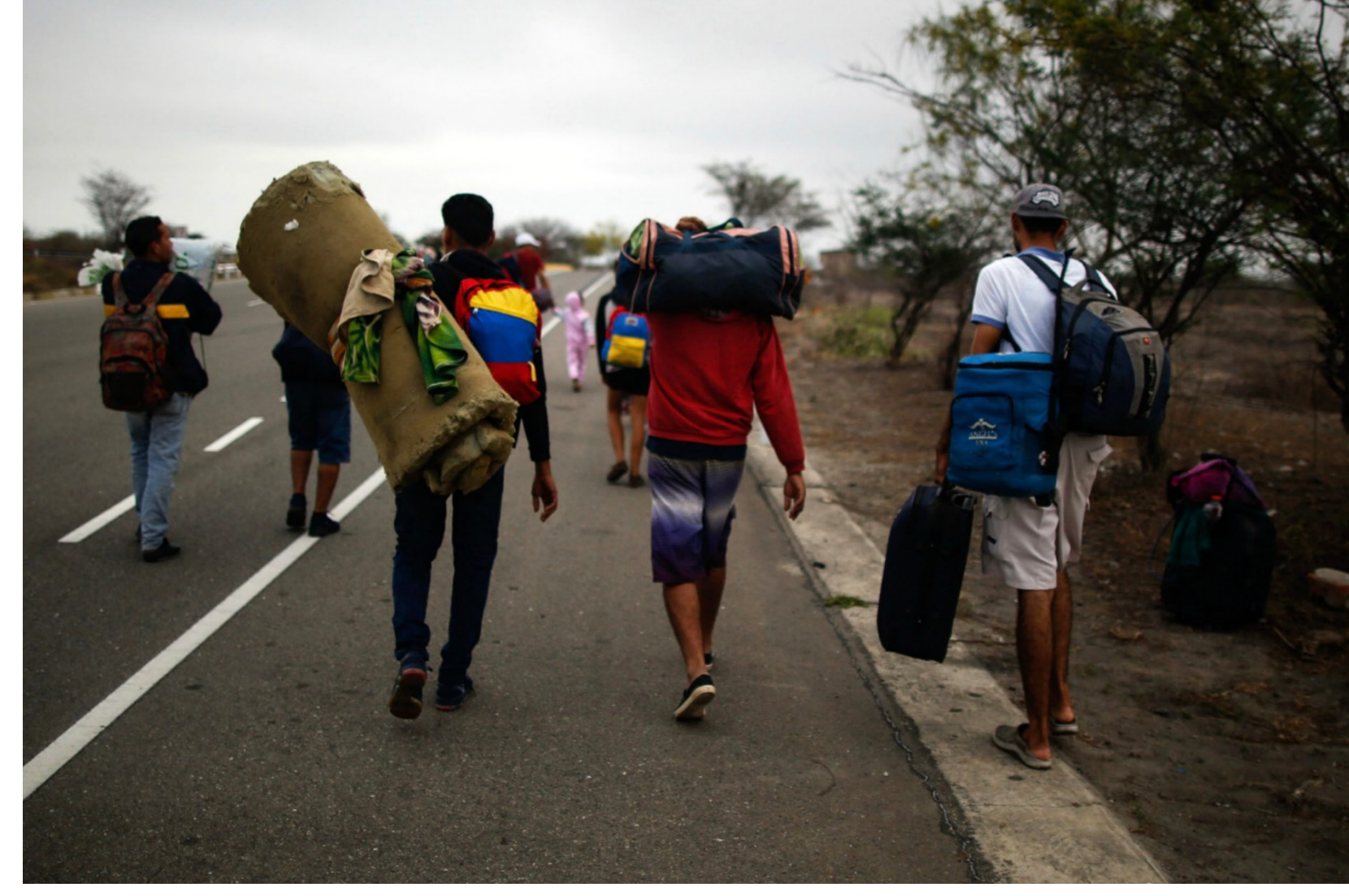
Figure 3. Footage of a group of Venezuelans caminantes -walkers- on their journey to Ecuador.

One of the most important ways to integrate young migrants into society is through education. The lack of a strong educational system in the host countries, the asymmetry of information in the Walkers when compared to the host population, the irregular legal status and the discrimination they