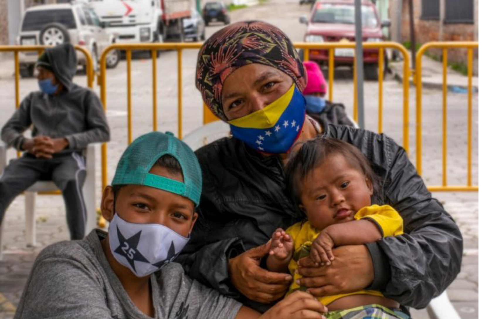
Figure 4. Over 5.6 million Venezuelans have left their country, most of them for countries in Latin America and the Caribbean.