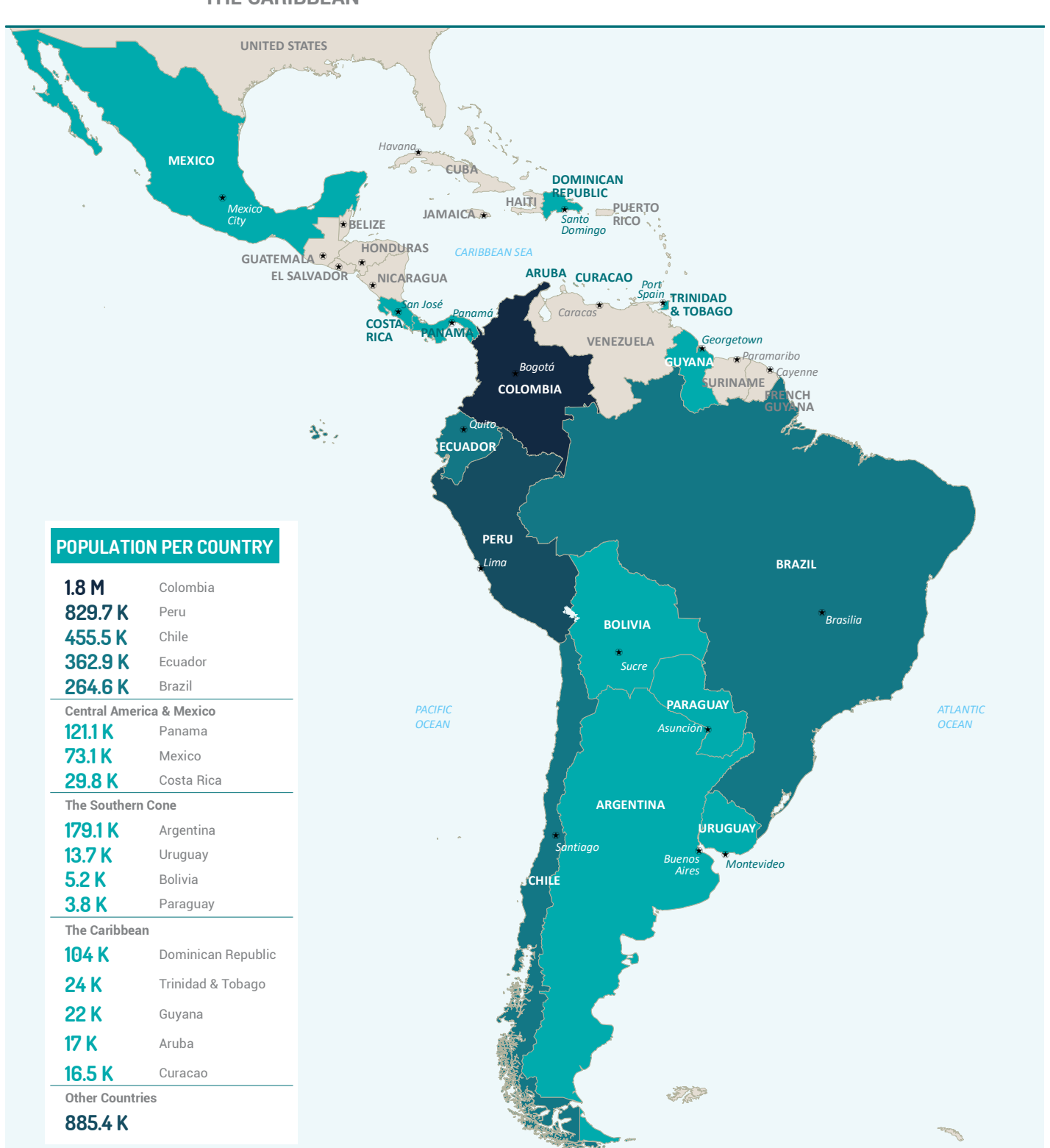
Figure 2. Venezuelan refugees and migrants in Latin America as for July 2020.

TOTAL APPROX. VENEZUELAN REFUGEES AND MIGRANTS IN THE WORLD