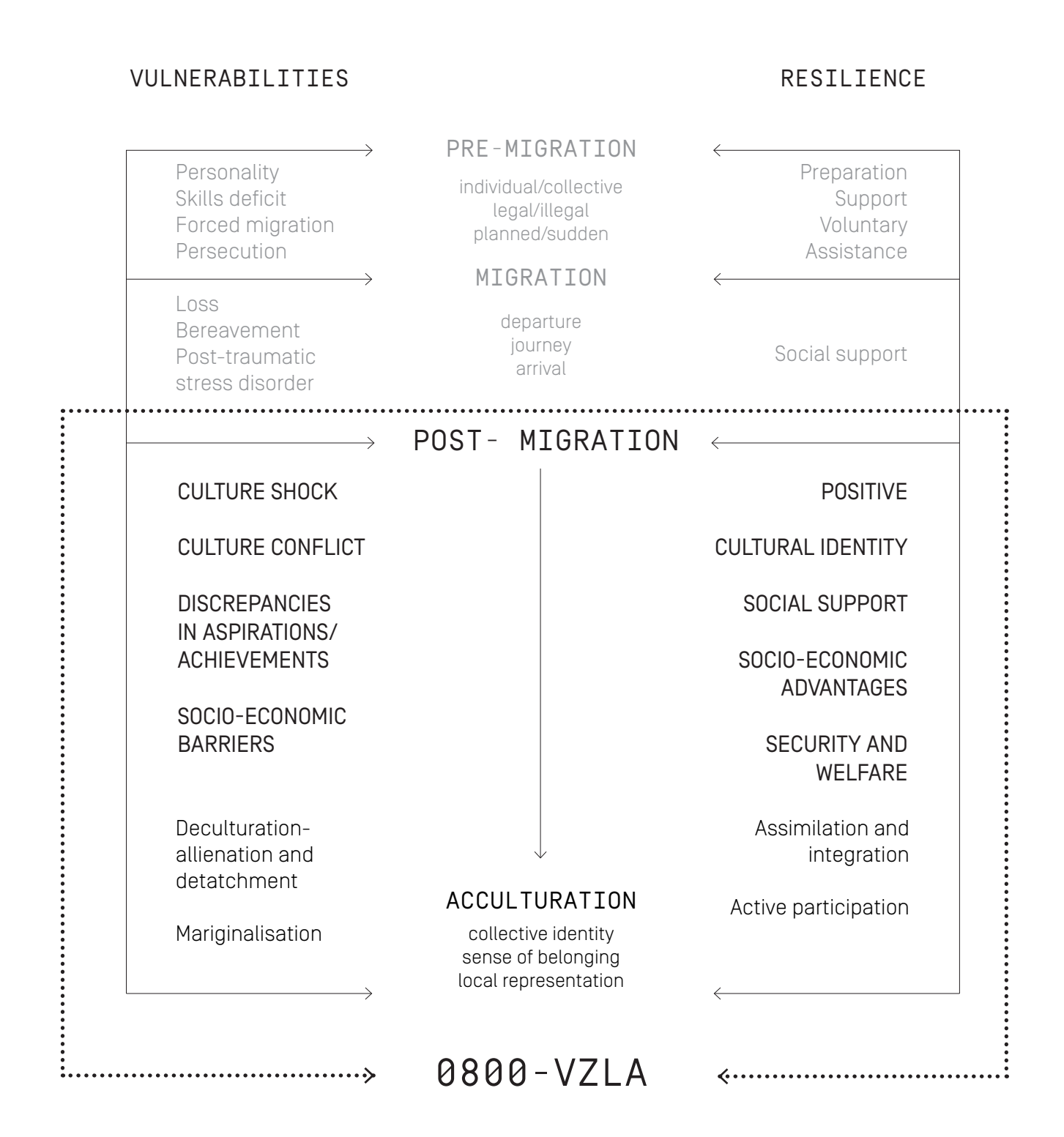
Figure 5. Representation by the authors on the scope of 0800-VZLA in Bhugra's contingency model.