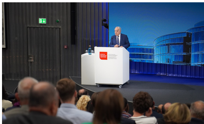
Ghassan Salamé, Professor of International Relations Emeritus, Sciences Po Paris, at the Opening Ceremony of the 2023–2024 Academic Year.