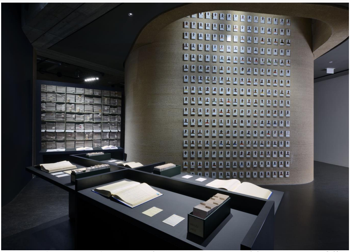
Image I: Picture of a subsection of the "restoring family ties" sub-exhibition. Kéré Architecture 2012 ©.14

I, for one, was brought back to my roots by "Colombia radio." Basically, this section of the exhibit contains many audio excerpts from a 2010 radio recording, with a small "historical bookmark" card titled "hostage-taking in Colombia" (in French, arrêt sur histoire, sequestrations en Colombie). The source was the famous radio show Las Voces del Secuestro (roughly translated, "Kidnapped Voices"), created by the war reporter Herbin Hoyos. After a brief period as a hostage of the Fuerzas Armadas Revolucionarias de Colombia — Ejército del Pueblo (FARC-EP) guerrilla group, Hoyos ran the radio show from 1994 until 2018. During this 24-year period, the families of those abducted sent out public messages of love and remembrance each morning, hoping that their loved ones—deep in the jungles and mountains of Colombia—would be able to hear the broadcasts from their radios. While I was fortunate not to have any close family or friends among