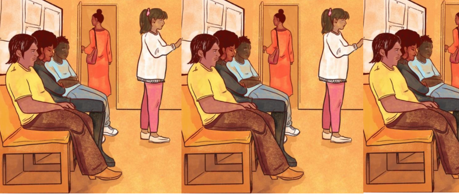
Illustration by Ada Jusic